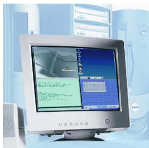
Real-time quad view

Be more productive, organized and efficient with the dynamic new QuadraVista Quad video KVM Switch from Rose Electronics.