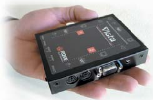
Vista-mini has Hi resolution video and stereo audio

Call us for more information on this excellent family of full-featured, easy-to-use, and economical KVM switches.