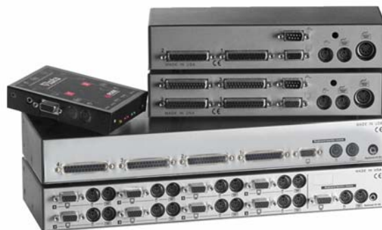
Rear view of Vista models KVL-8PCA, KVL4UA, KVT-2PC, KVM-4UPH, KVM-2UPH

■ Phone: 281-933-7673 ■ E-mail: sales@rose.com ■