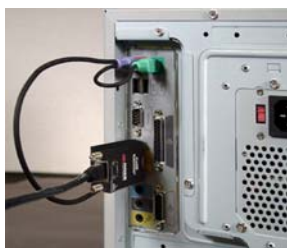
Direct connect CAT5 Transmitter streamlines your installation

As the inventors of the KVM switch, Rose continues to provide leading solutions for your server management needs. With headquarters in the US and offices in Europe and Asia, Rose provides a full range of capabilities and support. Call us today for more information about this and other Rose products.