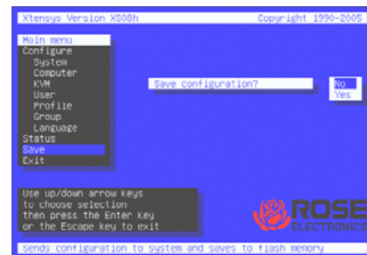
Easy to use OSD for configuration

■ Phone: 281-933-7673 ■ E-mail: sales@rose.com ■