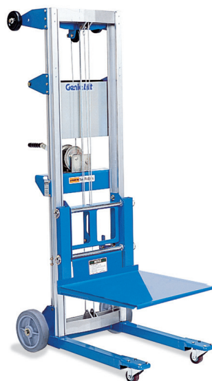
Standard GL™ Lift with Platform

The Counterweight Base Genie® GL™ Server Lift has a short leg length that enables you to work closer to the carried load. Available in GL-4, GL-8 and GL-10 models.