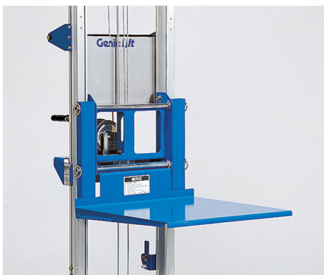
Load platform fits over forks and insures equipment is transported safely.