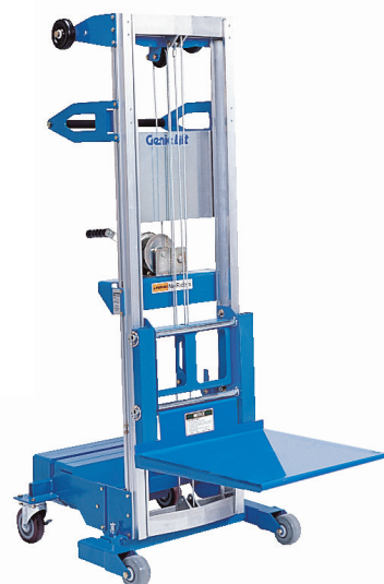
Counterweight GL™ Lift with Platform