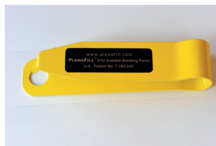
PlenaPop Hole Puncher 49-PF-PP