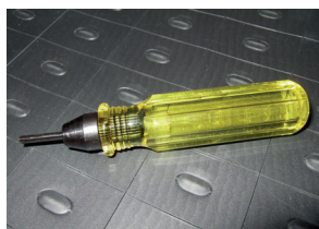
Screw Rivet X Head Screwdriver 49-PF-111-4