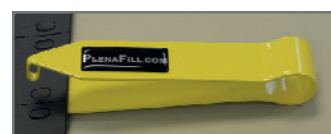
23" Panel Chad Remover 49-PF-23-Punch