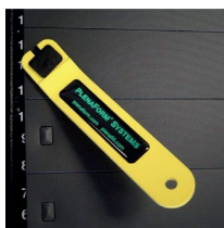
PlenaTool Rivet Remover 49-PF-PT