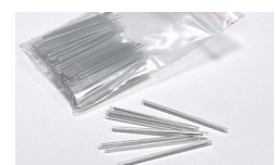
2.6x60mm Splice Protectors