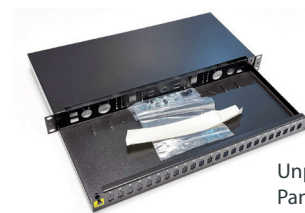
Unpopulated 1U 24 Port Sliding Patch Panel, including rack fixings