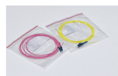
SM or MM LC-HQ Pigtails