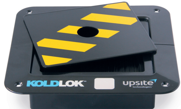
KoldLok® 5050 Cover* 46-10191