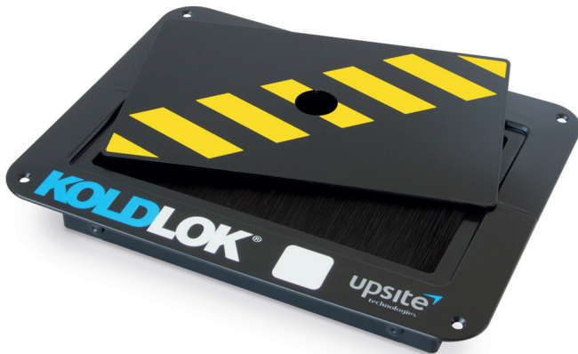
KoldLok® 1010 / 4040 Cover* 46-10187