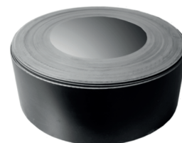
5.5" (140mm) Roll