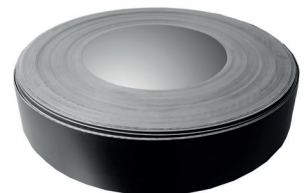
4" (102mm) Roll