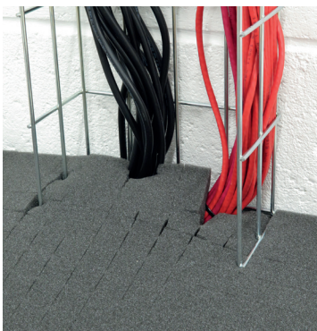
Use RackSEAL Floor to seal around cable basket entries