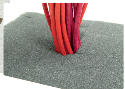
Before and after sealing cable openings with RackSeal Floor.