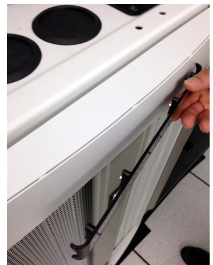
Temperature Strip 46-10125