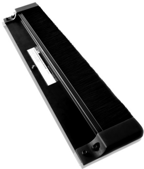
3" Extended 46-4000-10012