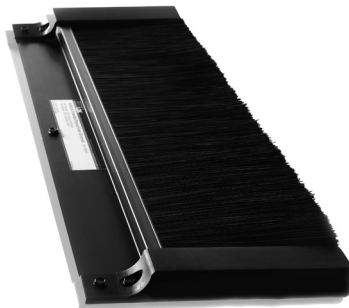
6" Extended 46-4000-10013