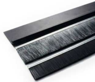
3" x 60" Extended 46-4000-10097