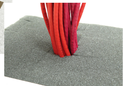
Before and after sealing cable openings with RackSeal Floor.