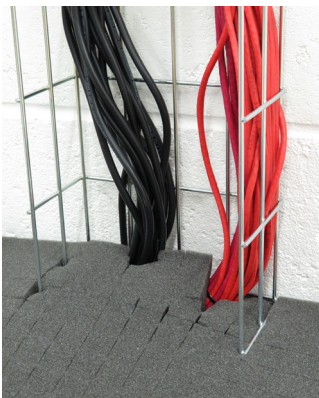
Use RackSEAL Floor to seal around cable basket entries